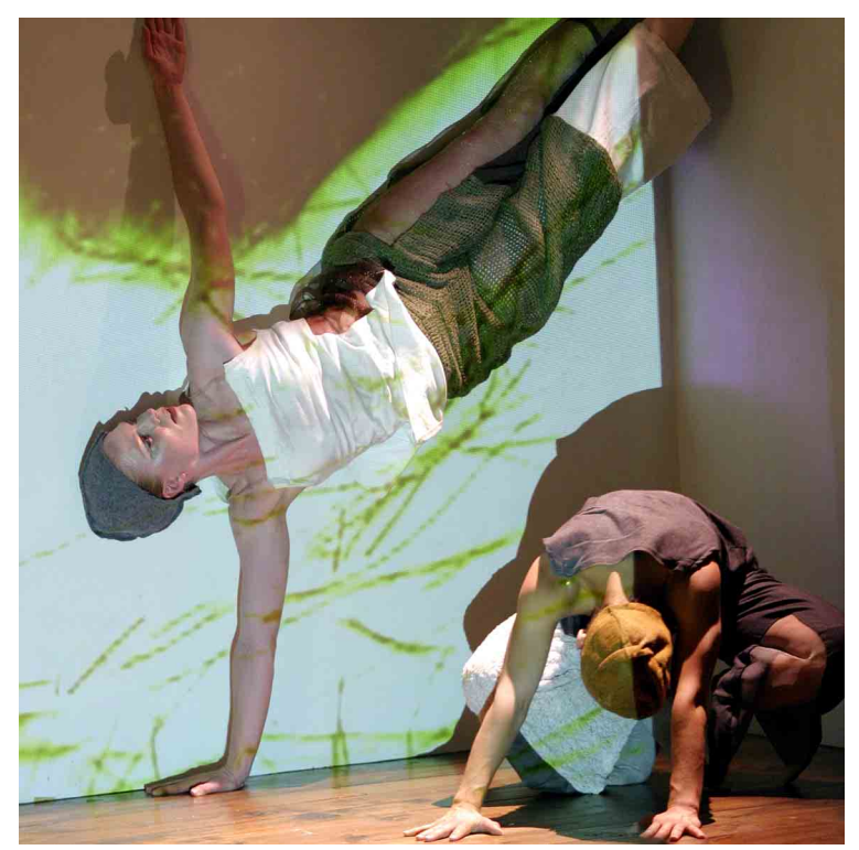
AMDaT under whose control - LMCC's SiteLines Festival 2004